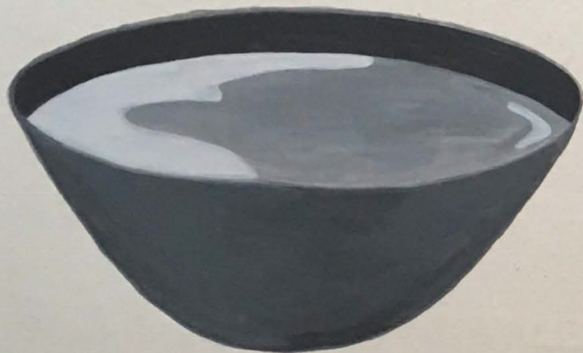
MELTING POT THEORY (Assimilation)

The immigrants allow themselves to fully integrate into the American culture and way of life. They give up their own cultural identity and adopt the new culture. They melt together into one American Nation.