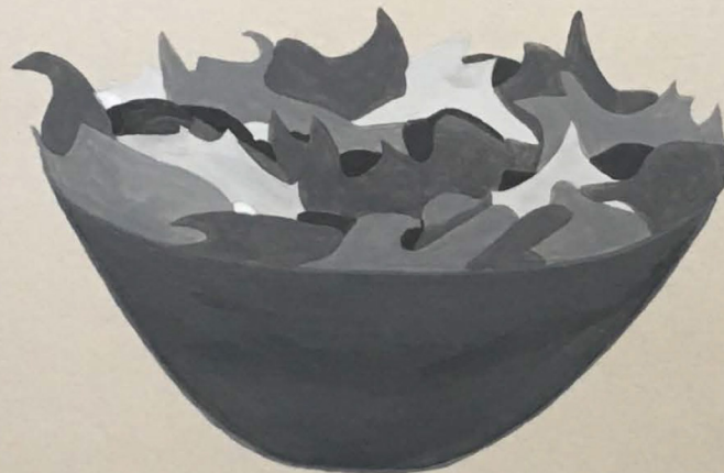
SALAD BOWL THEORY (Pluralism)

The immigrants allow themselves to fully integrate into the American culture and way of life. They give up their own cultural identity and adopt the new culture. They melt together into one American Nation.