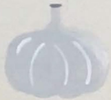
Black or African American